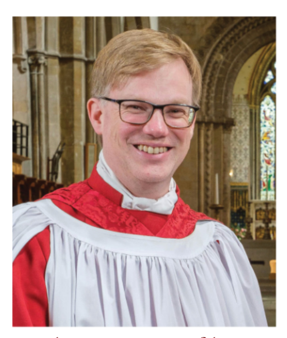
"The experience of being a Chorister is one that will remain with your child for the rest of their life."

We are delighted that you are interested in the possibility of a Choristership for your son or daughter. For children with a love of singing, there can be few better experiences than being a Chorister at Llandaff Cathedral.