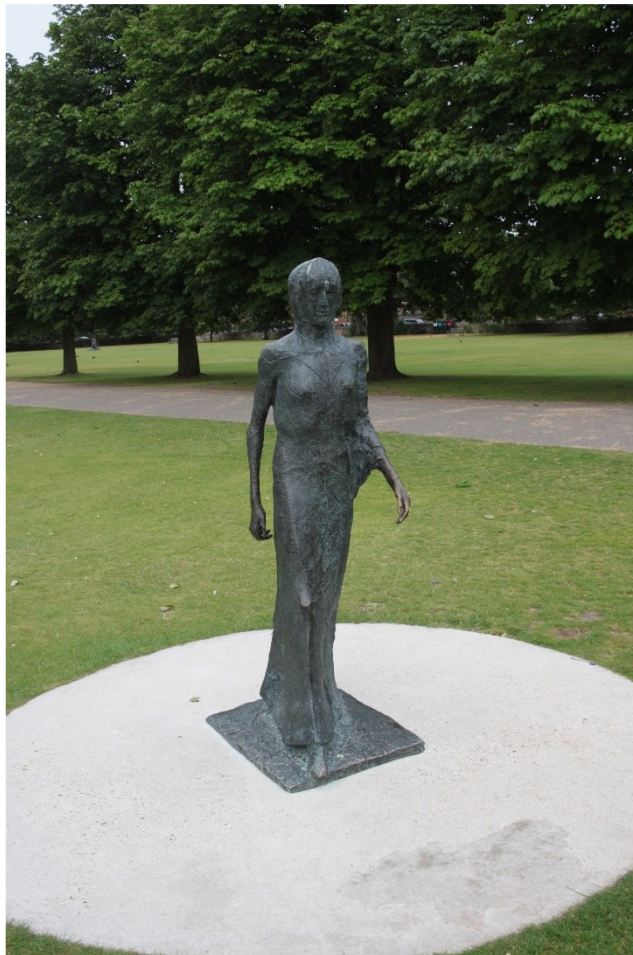
The Walking Madonna, photographed outside Salisbury Cathedral